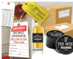
LABELS & TAGS