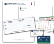
STATIONERY & FORMS

DNA Taggant Technology Security Numbering Encrypted Variable Data Colour Blockout Ghosting Holograms Chemically Reactive Paper Authentic Multi-tone Watermarks Fluorescent Fibres & Inks Thermochromic Inks Chemical Toner Anchorage Coin Reactive Inks Security Pantographs Micro-security Printing Numbering & MICR Encoding