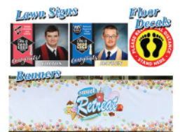
SIGNAGE & FLOOR DECALS