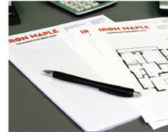
ENGINEERING, GRAPH & ISO