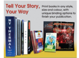
BOOKS & MAGAZINES