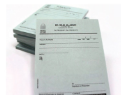
Rx PRESCRIPTION PADS