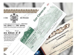
CERTIFICATES & VOUCHERS