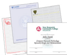
TRANSCRIPTS & DIPLOMAS