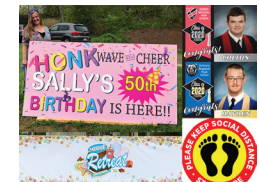
SIGNAGE & FLOOR DECALS