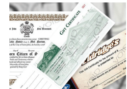
CERTIFICATES & VOUCHERS