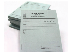
Rx PRESCRIPTION PADS