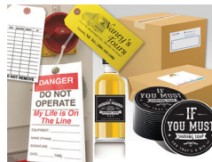
LABELS & TAGS