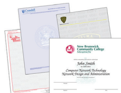
TRANSCRIPTS & DIPLOMAS