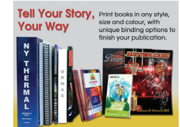
BOOKS & MAGAZINES