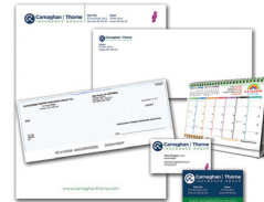
STATIONERY & FORMS